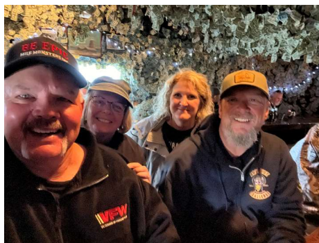
Inside the Salty Dawg