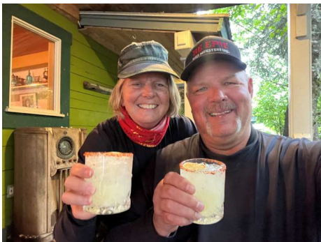
Cheers from Stewart

In Stewart, we had a room reserved for the night. Right across the street was a Mexican restaurant that had the best shrimp diablo and margaritas! A memory that we won't soon forget! 432 miles