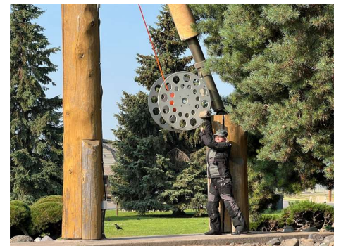
Largest Fly-Fishing Rod

August 10 - Our first stop today was the World's largest fly-fishing rod in Houston, British Columbia. I remember taking a picture of this on my trip in 2011.