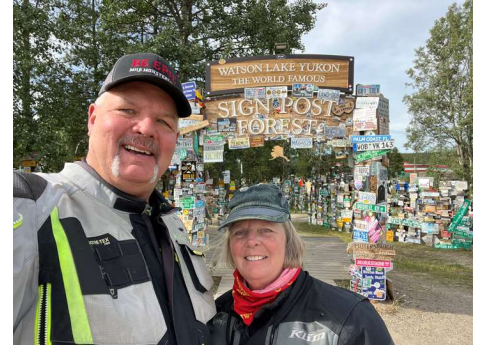
Sign Post Forest

The Sign Post Forest was started in 1942 by a GI assigned there on light duty. While recovering from his injury, he erected a signpost for his hometown of Danville, Illinois, 2,835 miles away.