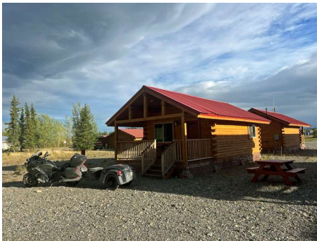
Cabin at Fast Eddy's

August 18 - Back on the road again! We started our trek back home and returned to Tok the same way we came. Just breathtaking! We had reserved a cabin at Fast Eddy's since all their rooms were booked. Of course, another great dinner at Fast Eddy's before we checked in! 538 miles