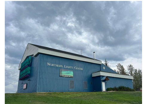
Northern Lights Centre

The small 100-seat planetarium style theater was great! We really enjoyed both shows. Afterward, we enjoyed dinner at the local Chinese restaurant again before checking into Andreas Motel. 274 miles