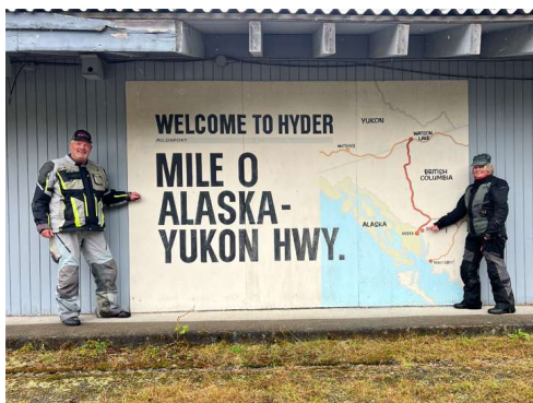
Cassiar Highway Map

What a trip it was!!! 9,454 miles in 24 days! We had the time of our lives! We couldn't have planned a better retirement trip than to Alaska! The things we saw, the challenges we endured, the remote wilderness we survived! Awesome beauty! Awesome friends! Awesome ride! Awesome time!