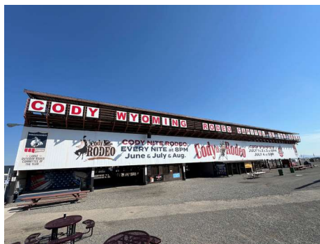
Rodeo Capital of the World

In high school, I remember attending the Cody Rodeo when my family drove to Yellowstone on vacation that summer.