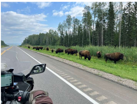
Wood Bison along the ALCAN

On both legs of our trip through British Columbia, we saw a few heliports for heli-skiing. Evidently, during the winter months, they would fly skiers up to the mountain tops where they would jump out and ski down. A rich person's sport for sure!