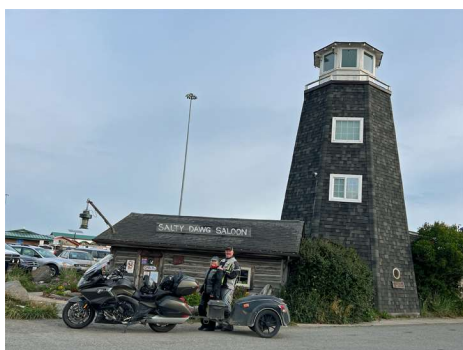
Salty Dawg Saloon

The Salty Dawg was an awesome little tavern at the bottom of an old lighthouse. A place we'd seen only in pictures. Inside, the walls and ceiling looked like shag carpet made of one-dollar bills. Of course, we had to write Team Campbell on a dollar bill, date it, and tack it to the ceiling too!