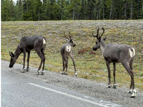
Caribou along the ALCAN

evidence of recent fires that caused the town to be evacuated a couple of months earlier. As we rode through, the town was back to normal.