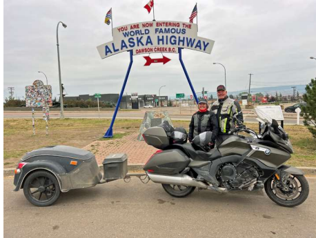
Iconic ALCAN HWY Sign

When we arrived in Dawson Creek, we stopped for a photo op at the iconic "Beginning of the Alaska Highway" sign.