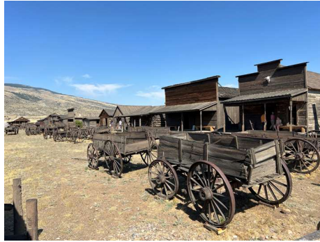
Old Trail Town