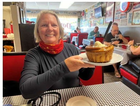
Jimmy's Down the Street

August 8 - We were on the road at our usual 7:00 am departure time. As we approached Coeur d'Alene, Idaho, Karen found a breakfast joint named "Jimmy's Down the Street"! It was a great place to stop especially since we were riding up to Homer to see our friend, Jimmy Burns! They had huge cinnamon rolls! They were delicious!